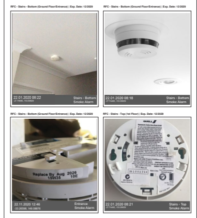
Locations Required For Compliance