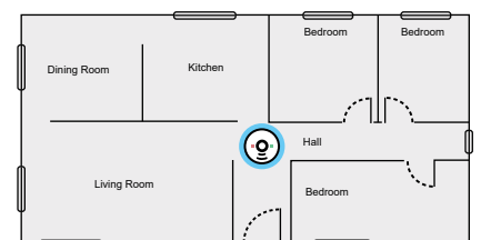
Single level home