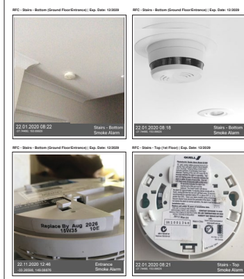
Locations Required For 2022 Legislation