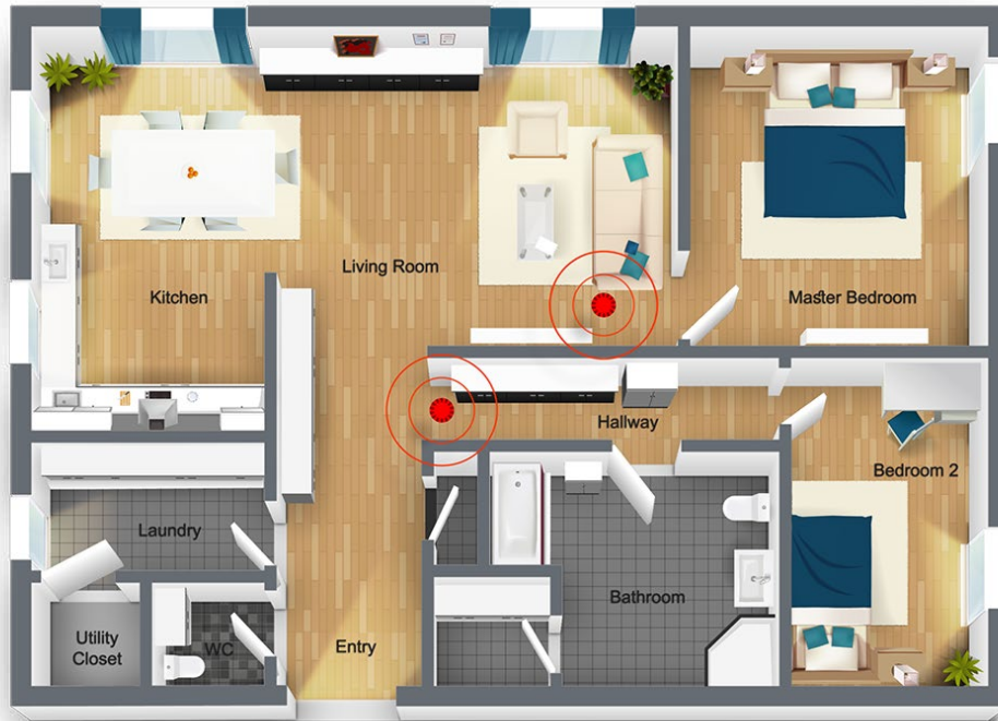
Red - Current Alarms.