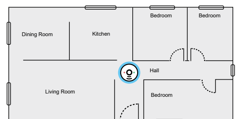
Single level home